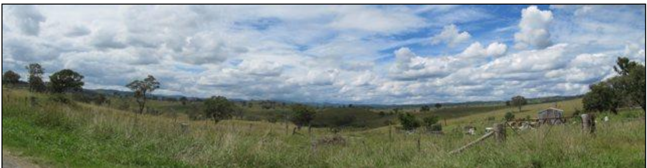
Beautiful countryside – views from the village

Group Leaders were chosen to oversee the implementation of projects in each key result area group. The Group Leaders can meet as a program committee to discuss projects or issues that arise in the community on a 'needs only' basis. Group Leaders and/or Project Leaders will report regularly and directly to the Wollomombi Local Area Committee on the progress of their projects.