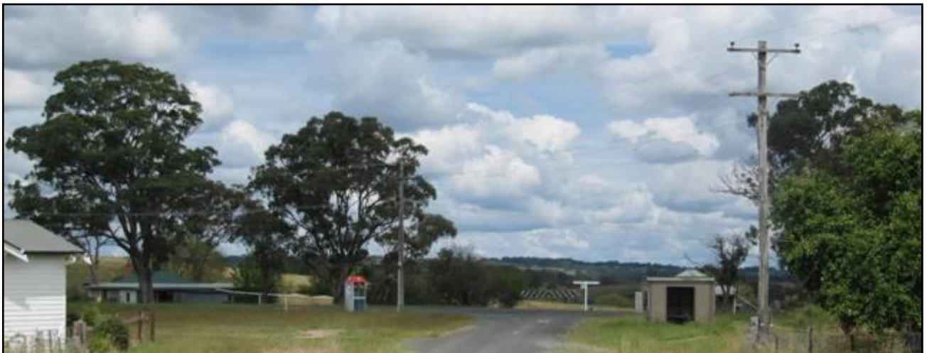
Fassifern Road junction with Wollomombi Village Road in village