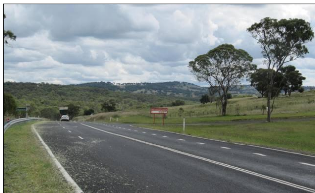
Turnoff to village from Waterfall Way