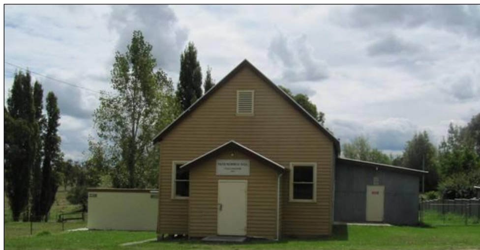
Sauer Memorial Hall