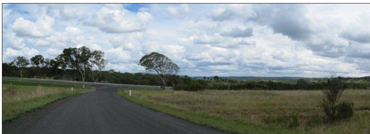
Village exit to the Waterfall Way