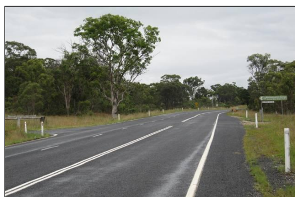
Poor turnoff signage to Wollomombi Falls