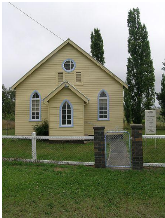
St John's Church