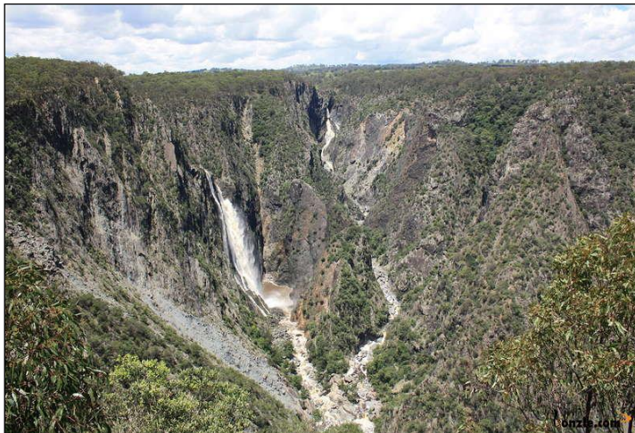
Wollomombi Falls merging with Chandler Falls (at the right)