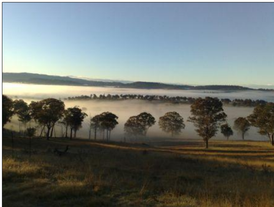
Chandler Valley

The Wollomombi community has developed their strategic plan, established an organisational structure to oversee the implementation of their projects in the plan and a line of communication between all stakeholders to update progress. Throughout their history they have been a strong and cohesive community with many achievements and they want to work together to develop a sustainable and successful future.