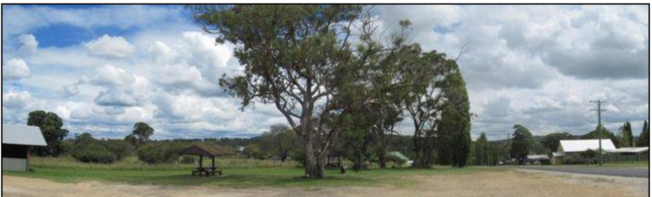
Wollomombi picnic area and shop

(photo front page: beautiful country - northern view at village entry)