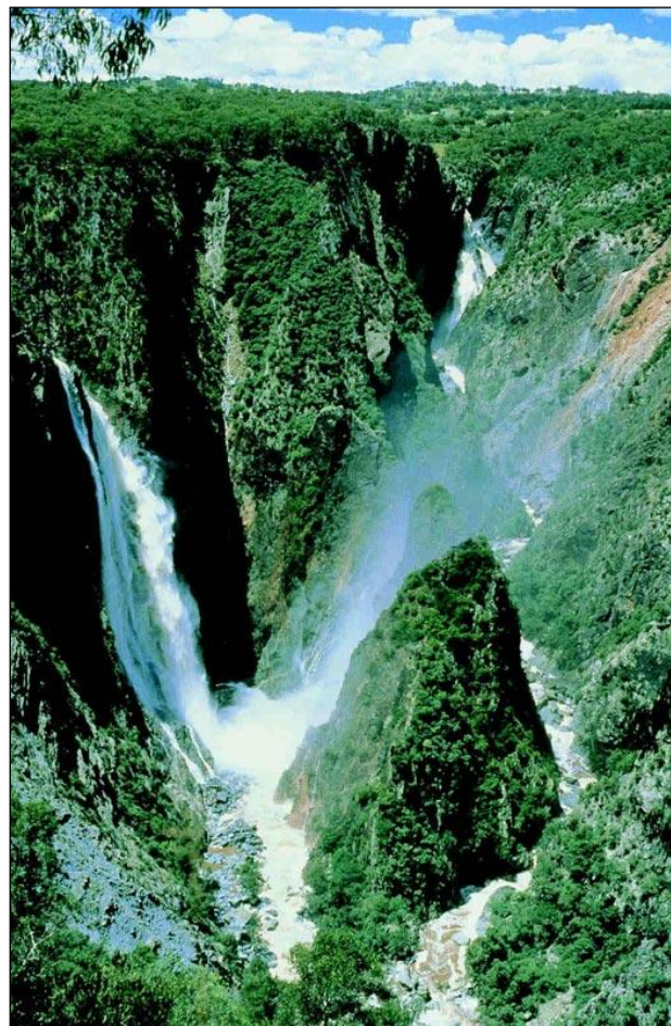
Wollomombi and Chandler Falls after the rain